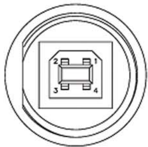
Pin Assignments Front View